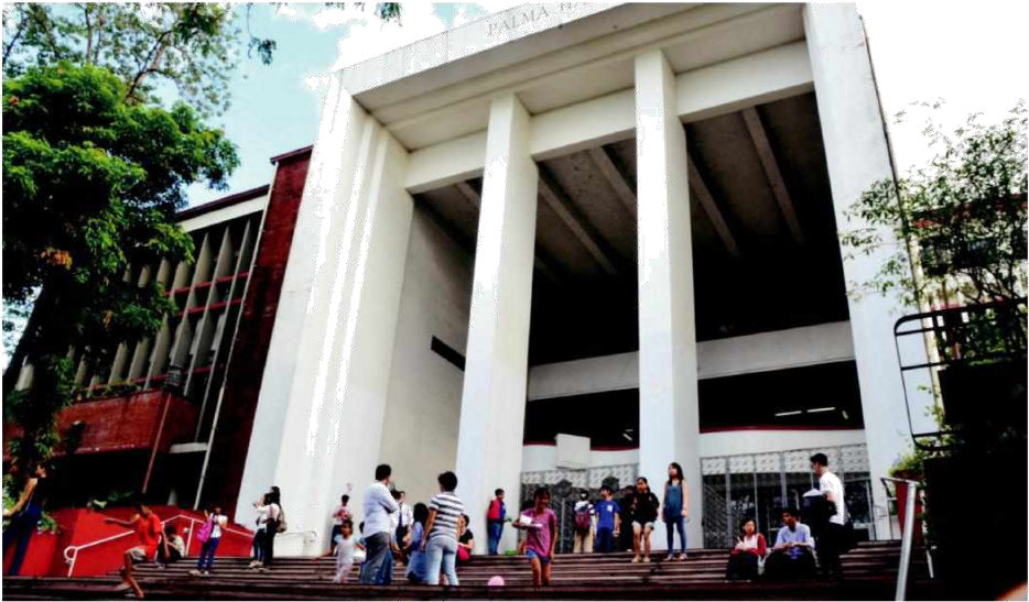
College of Social Sciences and Philosophy