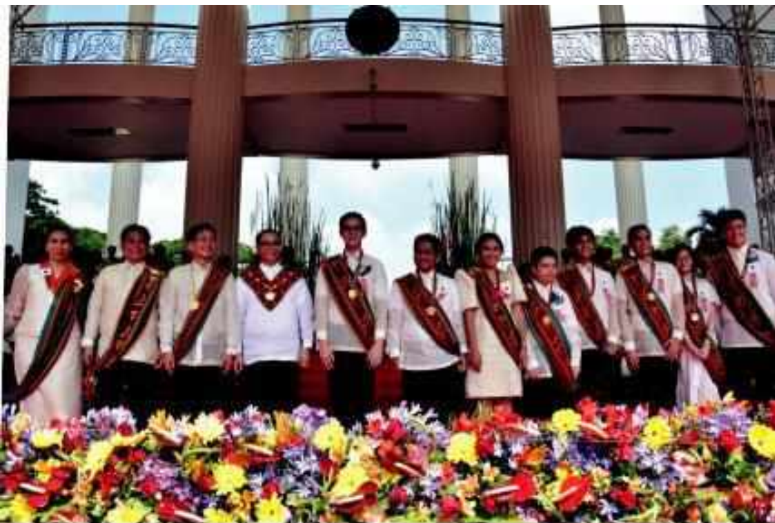
106 th General Commencement Exercises

Students who complete their courses with the following ABSOLUTE MINIMUM weighted average grade shall be graduated with honors: