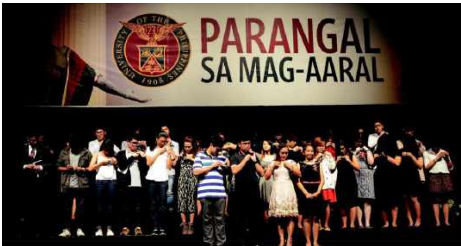
Parangal para sa mga Mag-aaral 2017

The effectivity of the scholarship is for the semester when such weighted average is obtained.